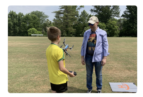
Learning to fly a drone